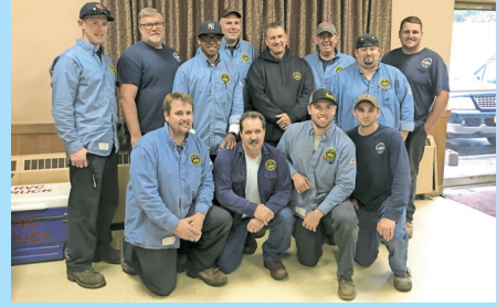
Power outages, while inconvenient, are a fact of life. Strong storms, car accidents and warm weather can cause a disruption in service. For many of us these outages are simply a hassle, but for others, they can be life-threatening. If there is someone

in your home whose health depends on an electrically operated device, it's important that you take these necessary precautions to prepare for power outages. The first provision to make is to call the Electric Department at (516) 678-9323 or (516) 678-9221 to find out how your name can be added to the life support list. Please note, a letter from your health care provider stating you are on medical equipment is needed. In the event of a storm, customers on the life support list will be given a priority for restoration along with critical facilities and other emergencies (wires down, etc.). Other safeguards include: